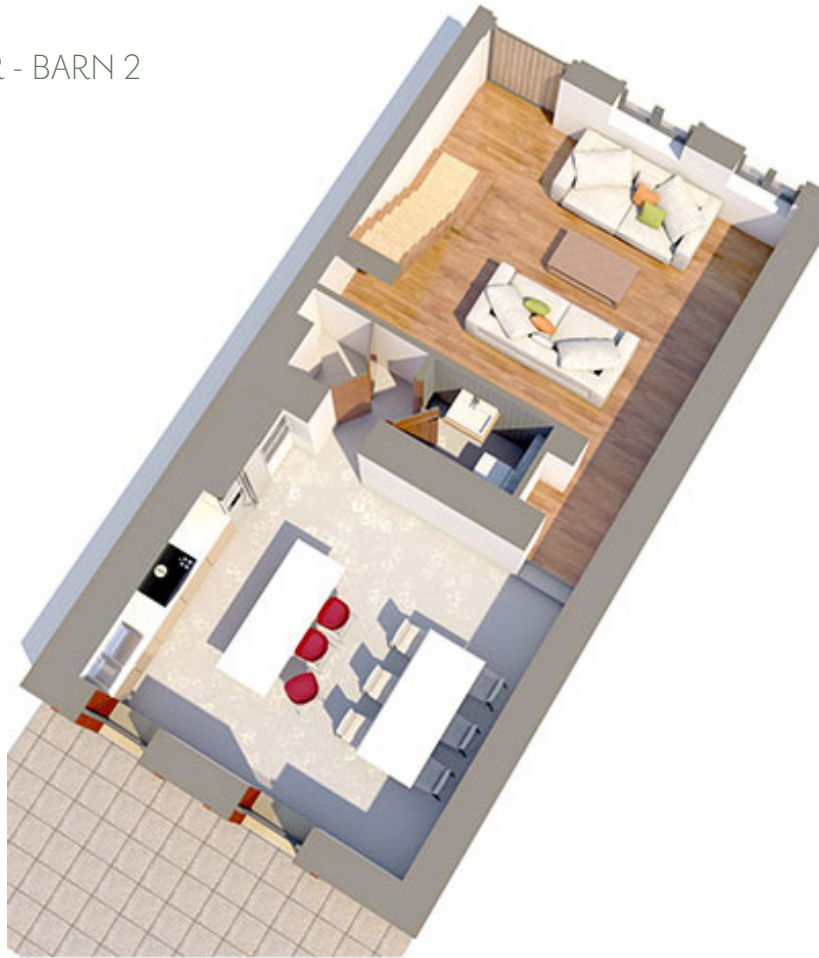
GROUND FLOOR - BARN 2